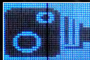
Used with Radar to display traffic speed