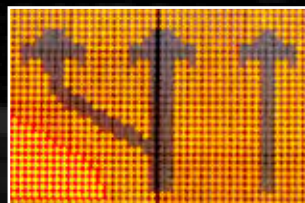
Road Work Signs

The Fold-up VMS is perfect for short term roadwork signs, emergency services, shop front advertising or event promotion.